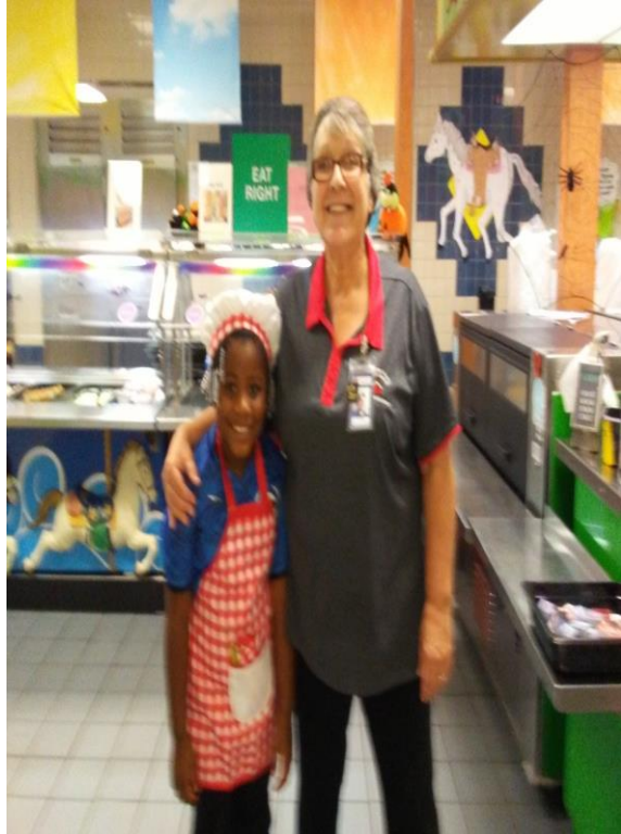
Career Day Dixon Primary