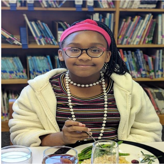
Holley Navarre Intermediate