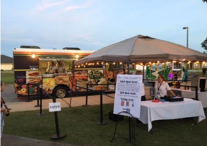
Woodlawn Beach Middle School Vendor Fair