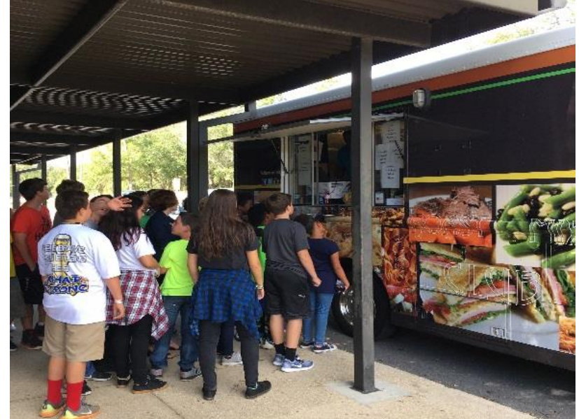
Hobbs Middle School New visit