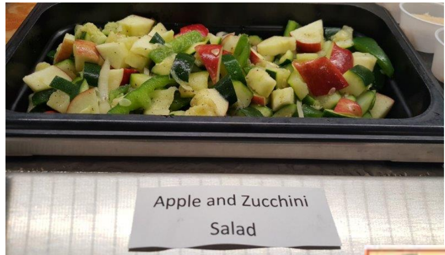
Apple and Zucchini Salad Gulf Breeze Middle