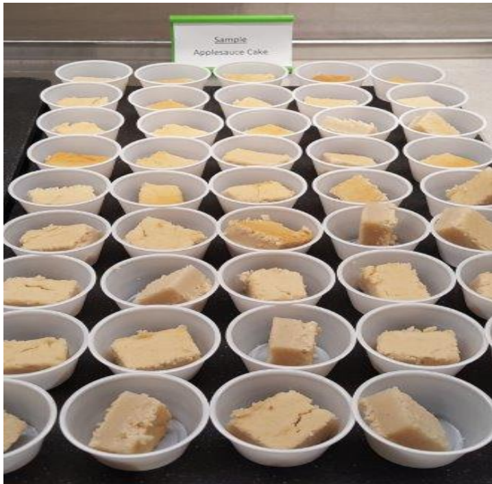
Applesauce Cake Gulf Breeze Middle