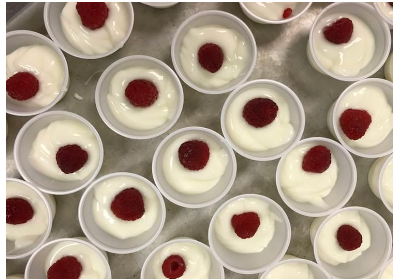
Yogurt with Raspberry Holley Navarre Intermediate