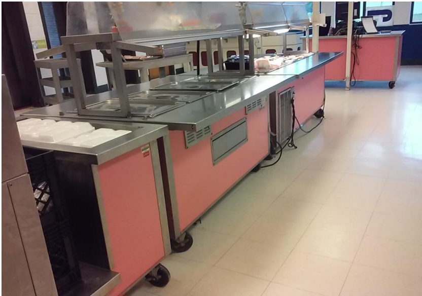
Jay Elementary “Before”