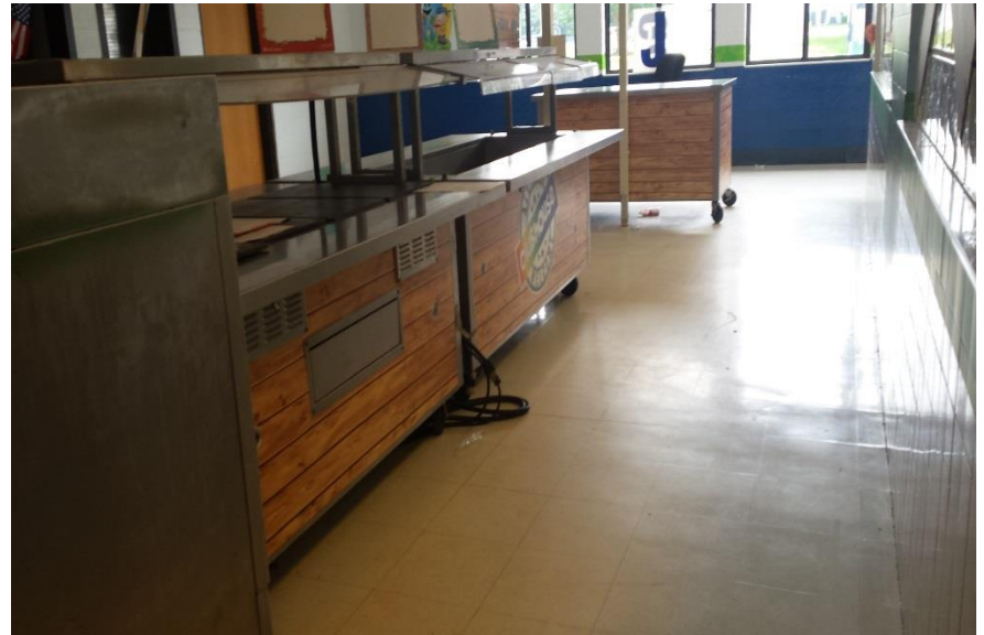
Jay Elementary “After”