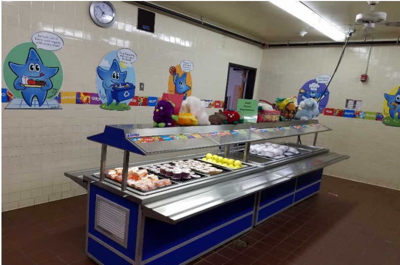
Pea Ridge Elementary “Before”