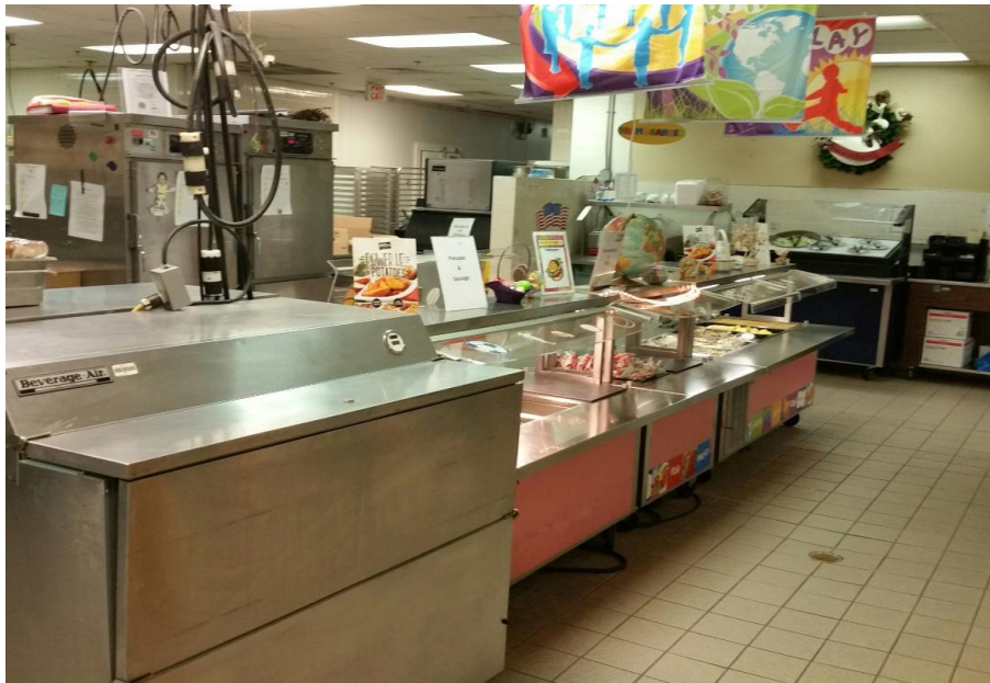
Berryhill Elementary “Before”