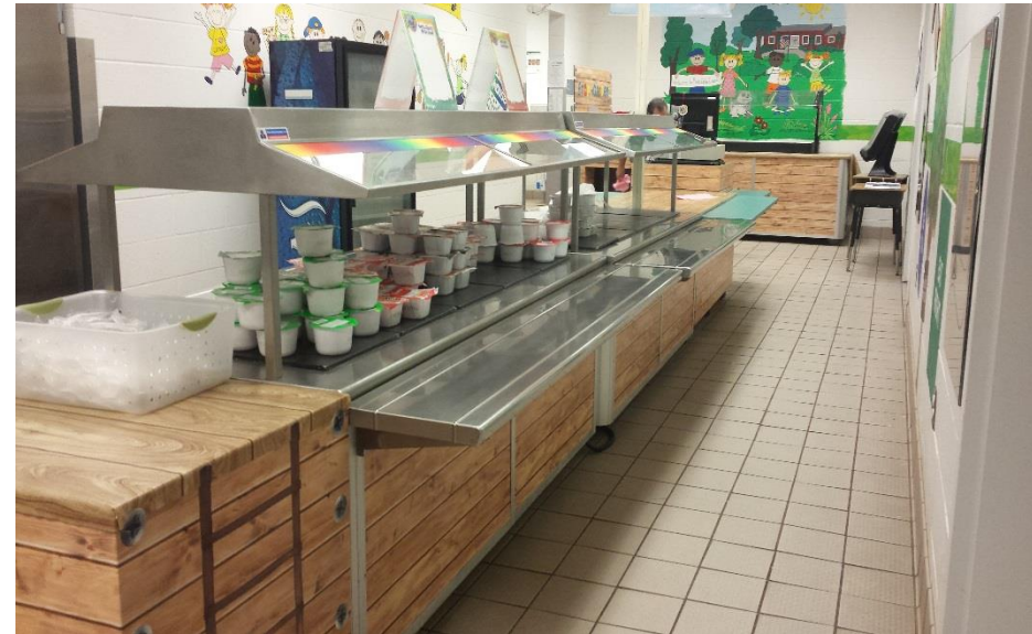
Bagdad Elementary “After”