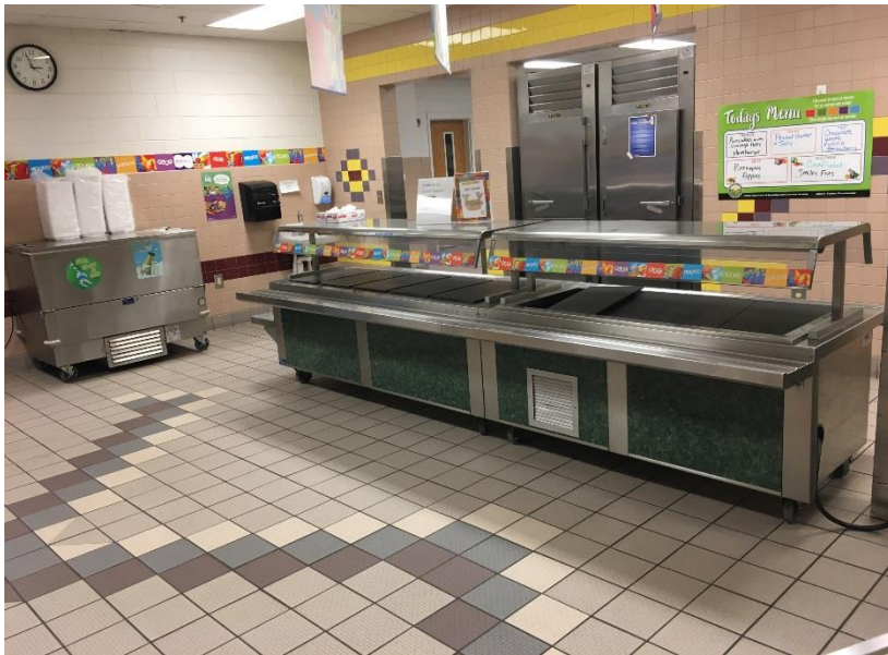
Holly Navarre Primary “Before”