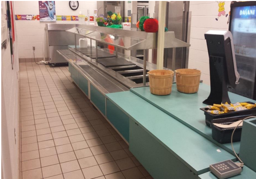
Bagdad Elementary “Before”