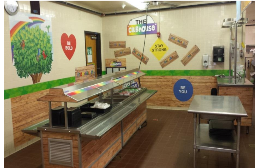
Pea Ridge Elementary “After”