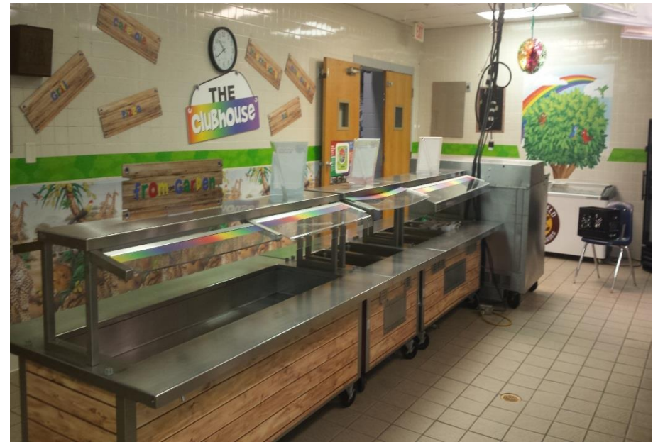
Berryhill Elementary “After”