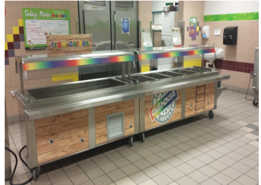
Holly Navarre Primary “After”