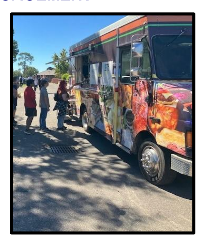
Food Truck at Milton High Homecoming