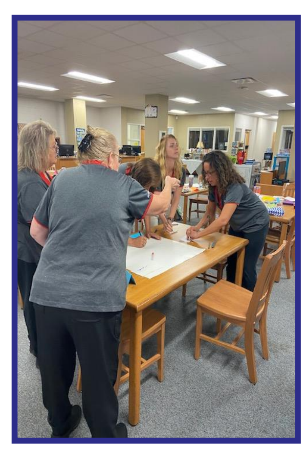
-Team Building, -Presentation Skills, -Conflict Resolution