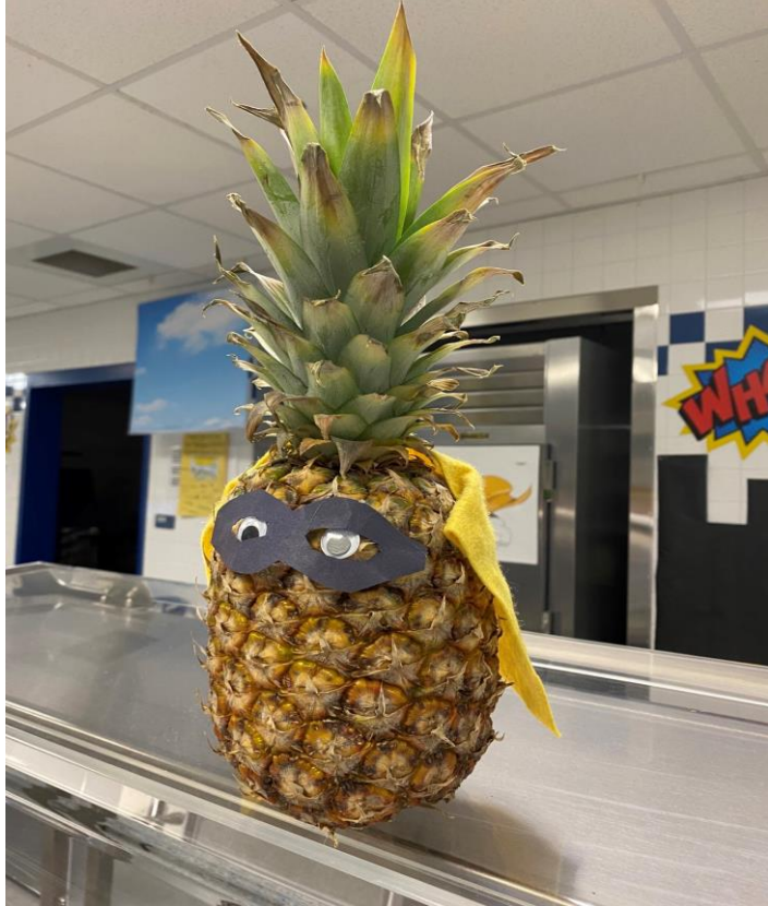
Holley Navarre Intermediate