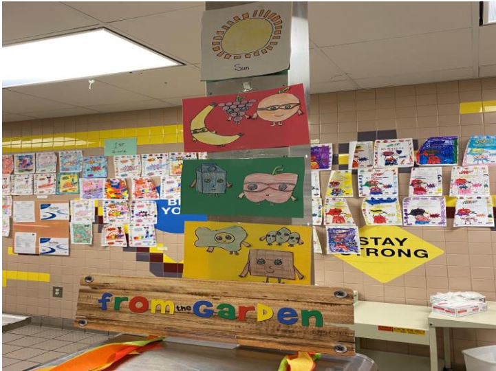
Holly Navarre Primary