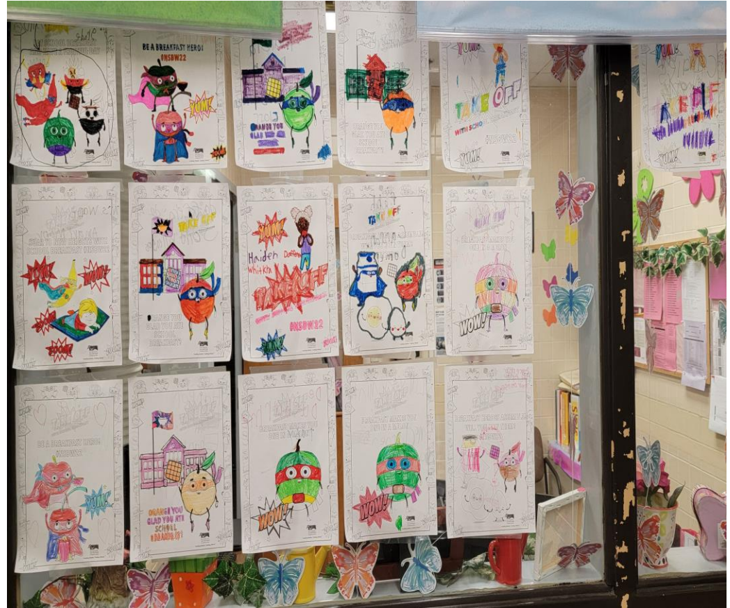
Pea Ridge Elementary