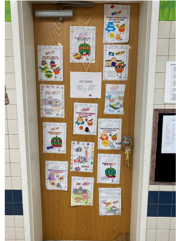
Gulf Breeze Elem.