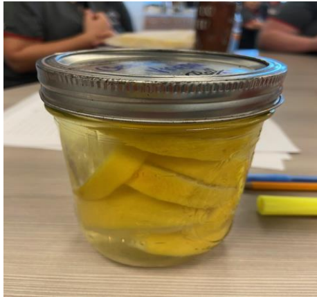
Lemon Vinegar cleaner