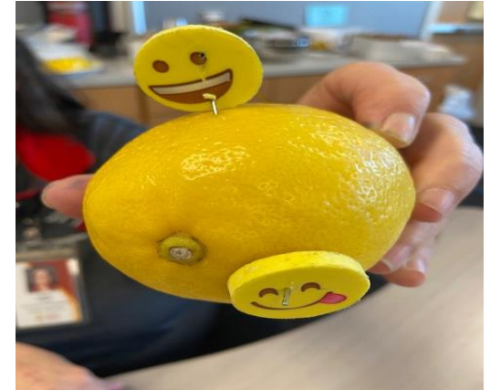
Just "be happy"!