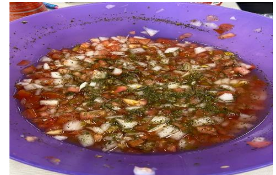
Pico da gallo

What to do with your lemon when you don't nurture it?