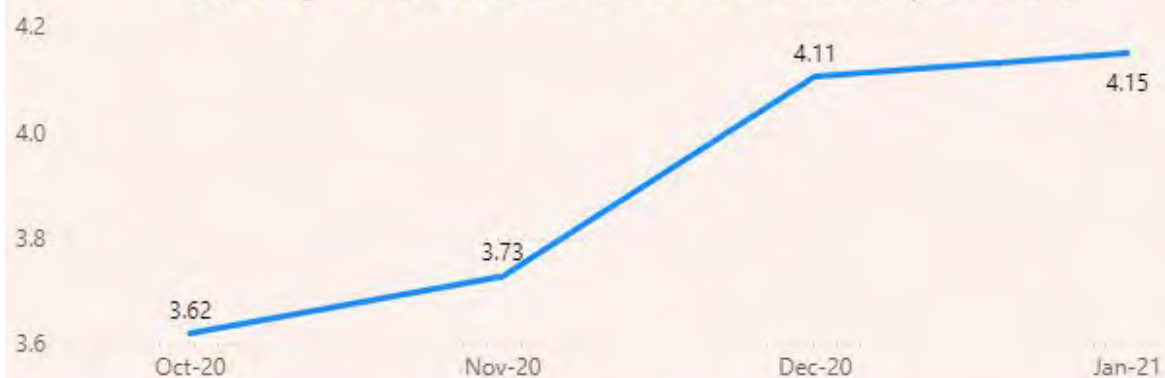
Average of Overall Standard Contract Report Card