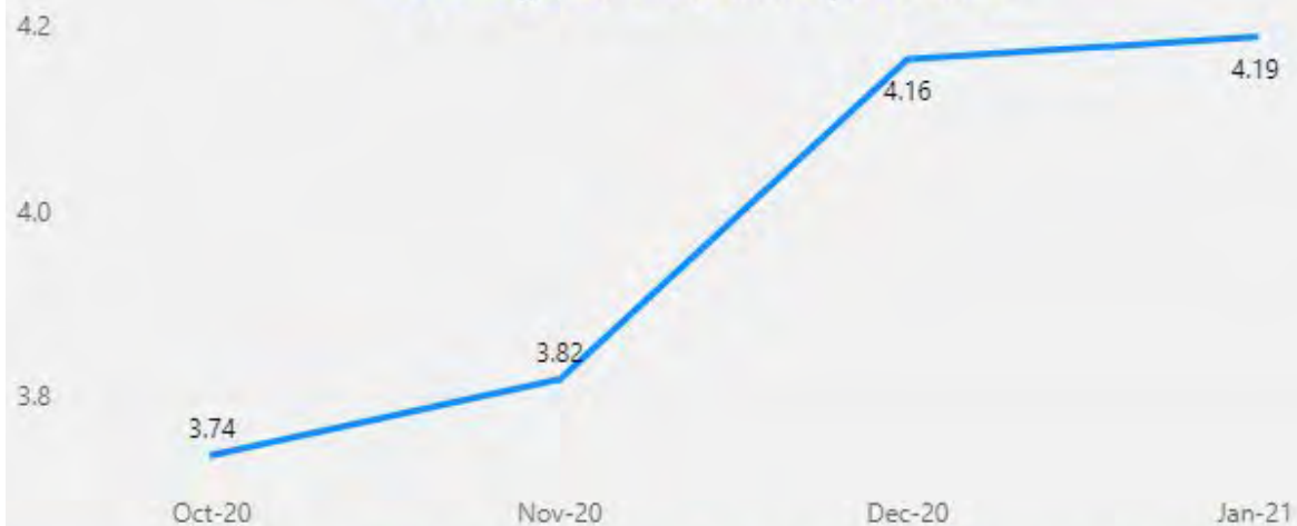
Average of Overall Report Card