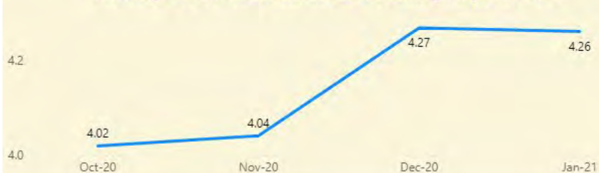
Average of Overall Enhanced Cleaning Report Card