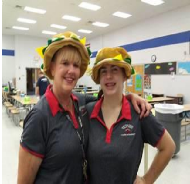
National Cheeseburger Day