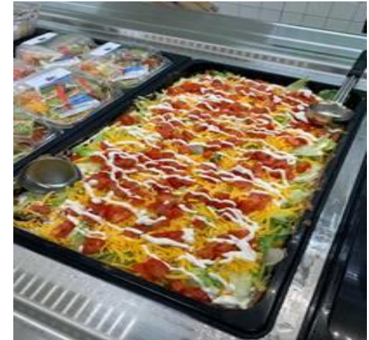
Celebrating Hispanic Heritage Month with Chicken Enchiladas and 7 Layer Dip