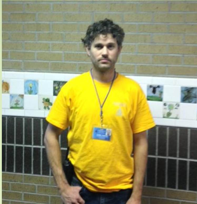
CHRIS CORTEZ DIXON INTERMEDIATE