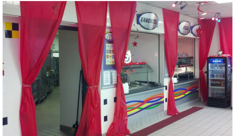
Gulf Breeze High