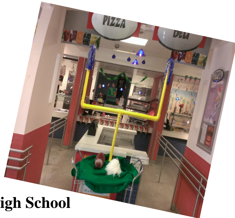
Pace High School