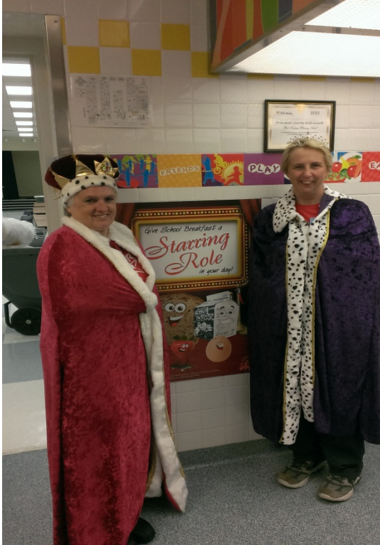
Staff at West Navarre Primary