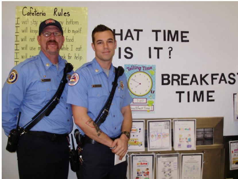
Local fire fighters visiting Woodlawn Beach Middle school