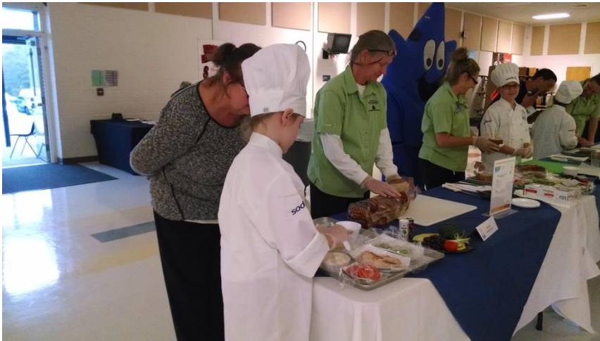
Future chef participants creating their culinary delights.