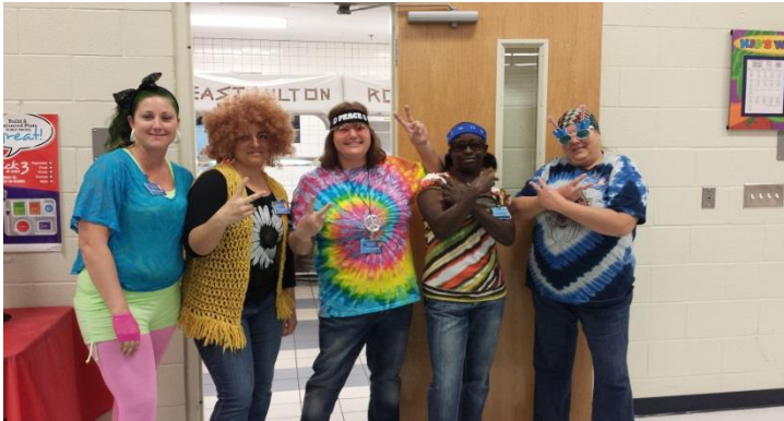
Food Service staff at East Milton Elementary and Woodlawn Beach Middle